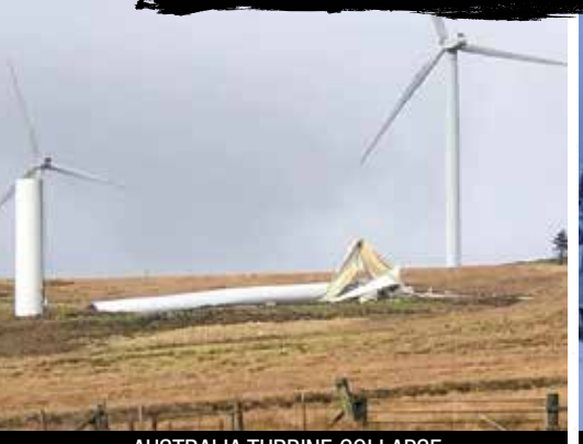
AUSTRALIA TURBINE COLLAPSE